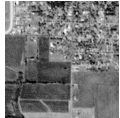
Sample Grayscale Image

Filters in the Sharpening group are designed to enhance the appearance of images, primarily by sharpening edges, corners, and line detail. Two of these filters (High Pass and High Boost) are simple convolution filters that use a set of filter kernel coefficients to compute a weighted average of the image cells in the filter window. In the Spatial Filter process the filter weights for these filters can be viewed and edited on the Kernel tabbed panel. The remaining filters in this group do not use kernel coefficients, so the Kernel panel is inactive when they are selected. Some of the filters in the latter subset also suppress image noise so that the main image content is preferentially accentuated.