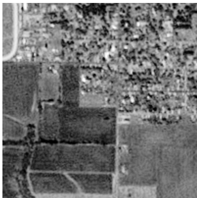
High Boost 3 x 3

The High Boost filter is a milder form of the High Pass filter. The default weighting coef-