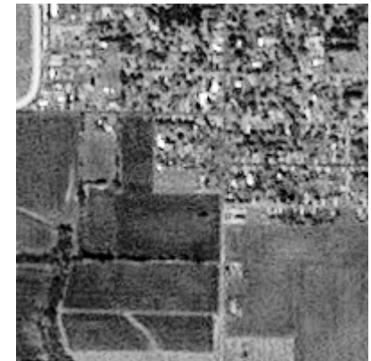
Volterra Unsharp 3 x 3 Sharpen = 0.007

The Volterra / Unsharp filter is an edge-enhancement filter in which the amount of enhancement is proportional to the local image brightness. The varying edge-enhancement is meant to account for a significant property of the human visual system: image details involving a given brightness contrast are more easily recognized in dark areas than in bright image areas. Edge details in bright areas therefore require more enhancement than those in dark areas of the image, and image noise that is amplified by a filter is more noticeable in dark areas.