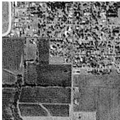
High Pass 3 x 3

The High Pass filter is a linear convolution filter that selectively enhances local features (high spatial-frequency components) of an image while maintaining the larger-scale features. This filter subtracts an averaged (smoothed) version of the image surroundings from each image cell, accentuating local features.