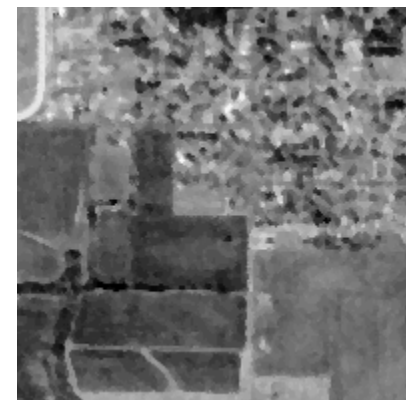
WMMR-MED 3 x 3