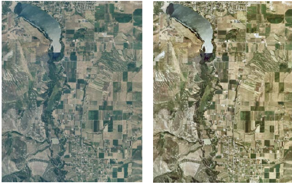
Left, a natural-color 1-meter orthoimage color-composite of an area in Utah, USA. Right, colorcomposite image produced by the Apply Contrast process using Exponential contrast tables for the Red and Green color components and a Linear contrast table for the Blue component.

Apply Contrast window with RGB color composites selected for processing. Separate contrast options can be set for each color component (Red, Green, and Blue) for each input raster.