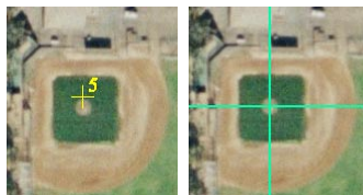
GPS control point in estimated image location after import (left), and relocated to its correct image position using Edit mode (right).

Control point list after import of GPS points (5 through 13; points 1 through 4 are corner points from the image's original affine georeference). If you have included a Name column in the point list (selected using Options / Columns), point names from the GPX file are shown. Map coordinates from the GPX file are automatically converted to the reference coordinate system if necessary. The previous control points and the selected residual model are automatically used to estimate image coordinates (shown in red) for the imported points. Switch to Edit mode to correctly position the imported points relative to the input image.