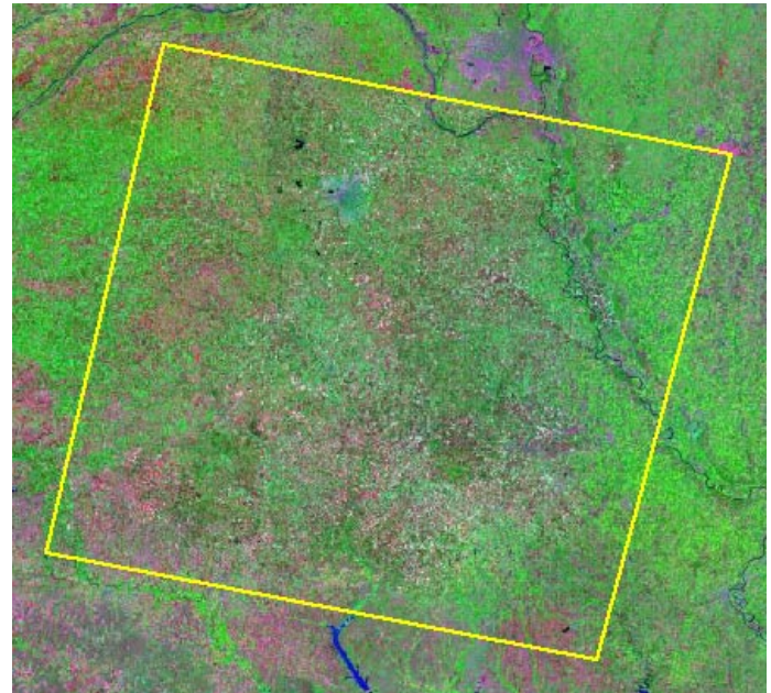
Reference Image: The global Landsat 742 standard web tileset published by Microimages for use in TNTmips was used via the internet for this auto-registration. The yellow box shows the approximate area covered by the 2009 Landsat 5 scene.

This ~750 gigabyte standard web tileset is available as a reference for all land areas between 50 degrees south and 50 degrees north latitudes. It was constructed from 879 false-color pan-sharpened Landsat image mosaics at 14.25 meter resolution acquired circa 2000 ( https://zulu.ssc.nasa.gov/mrsid/ ). The Tileset Export and Tileset Merge processes in TNTmips were used to create this single global tileset.