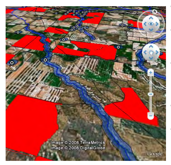
Site selection analysis results for rural development rendered to KML and displayed in Google Earth.

Use TNTmips to lay out map data for printing, distribution as PDF files, or as electronic atlases.