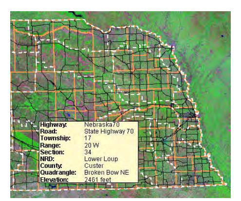
Create and edit spatial data and attach desired records to the elements to easily identify rural assets.

Create and edit your map layers in the form of vector, CAD, TIN, shape, raster files and spatial databases to organize spatial information related to rural sites and communities.