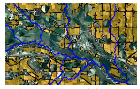
Irrigation and hydrology data displayed over an orthophoto.