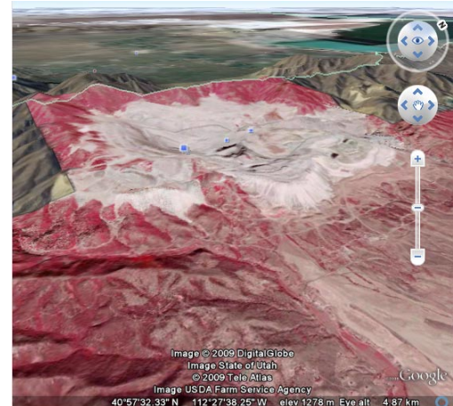
Perspective view in Google Earth of the Super-Overlay created from the small mosaic layout shown on this page. Google's Super-Overlay tileset structure provides the fastest possible display of your very large overlays in Google Earth.