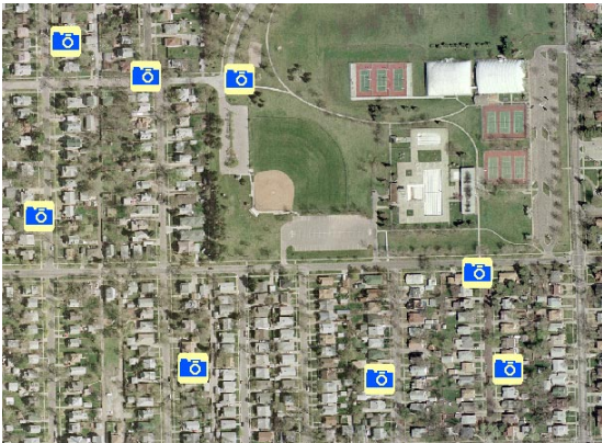
Pins selected by date and time.

The DATETIME class members and methods can be used in a script to select photos taken on a particular date or before or after a certain date and time. The photos in the sample table were taken from 14 November 2004 through 7 July 2005. The sample script selects photos taken after 12 noon on 1 June 2005.