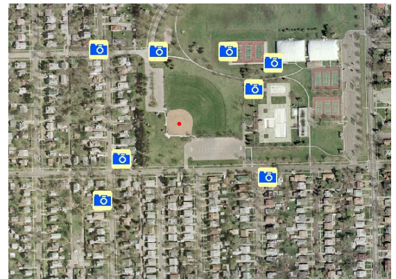
Pins selected by proximity to reference point (red dot).

NOTE: These sample scripts can be found in the SelectionQuery directory of the TNT 2007:73 Sample Scripts collection (available from www.microimages.com/downloads/scripts.htm ).