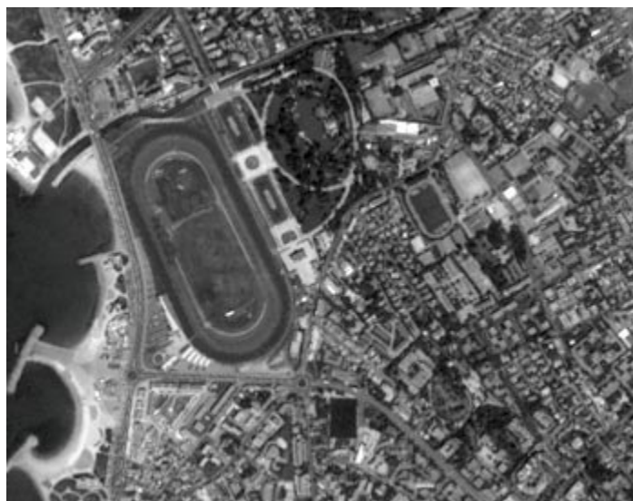
Same subarea of the 5-meter SPOT panchromatic source image.

Accurate cell-by-cell spatial registration of the pan and MS images is required to produce good pan-sharpening results without image artifacts. As a start, both source images must be accurately georeferenced. Orthorectified source images were used for the example shown here, as they provide the best registration of internal image features in areas with significant topographic relief by correcting for relief displacement effects that may differ in the pan and MS source images. (Orthorectified Landsat images are available for free download from the Global Landcover archive at http://glcf.umiacs.umd.edu/portal/geocover/ .) Seasonal changes in vegetation and temporal changes in cultural features can also affect pan-sharpened images produced from source images acquired at different times; in this example summer images from successive years were used to reduce these temporal effects. Finally, the accuracy of color rendering in the pan-sharpened product decreases as the cell-size difference between the pan and MS images increases.