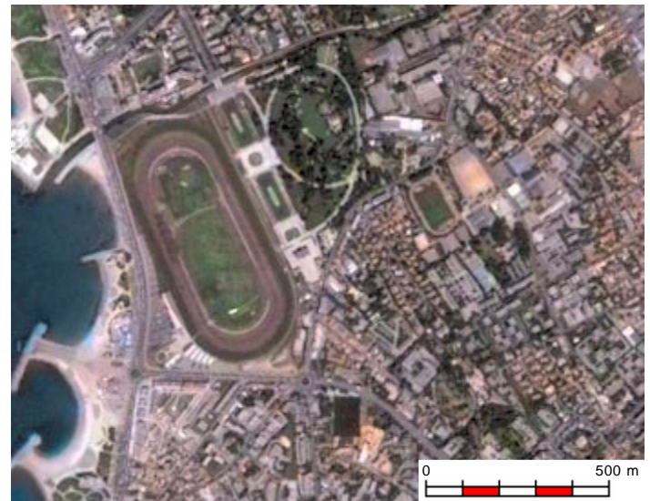
Detail of a 5-meter, natural-color pan-sharpened image of Marseille, France created in the Multiresolution Image Fusion process from the source images described above.