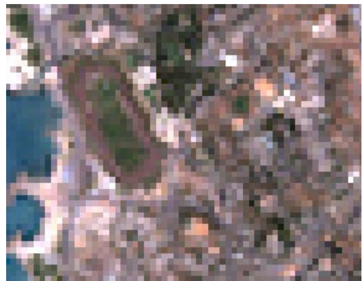
Same subarea of the Landsat ETM 28.5-meter source image.