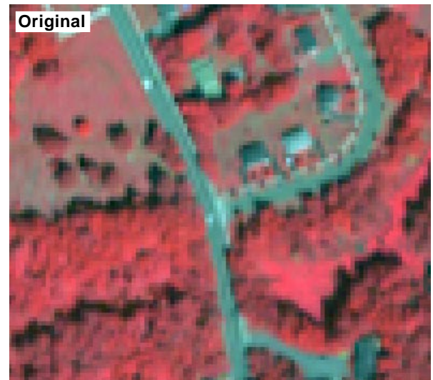
Color-infrared combination of image bands from a small portion of a QuickBird scene of an area in Vermont. Above, display of original bands (2.4-meter cell size). Below, same band set after pan-sharpening to 0.6-meter cell size reveals significantly more spatial detail.

Several color fusion methods are available in the Multiresolution Fusion process. Results from the Paris and Brovey methods are compared in the color plate entitled Multiresolution Fusion: Comparison of Pan-Sharpening Methods .