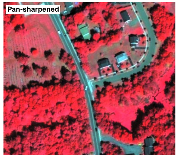
Summary of Multiresolution Fusion Inputs, Products, and Methods