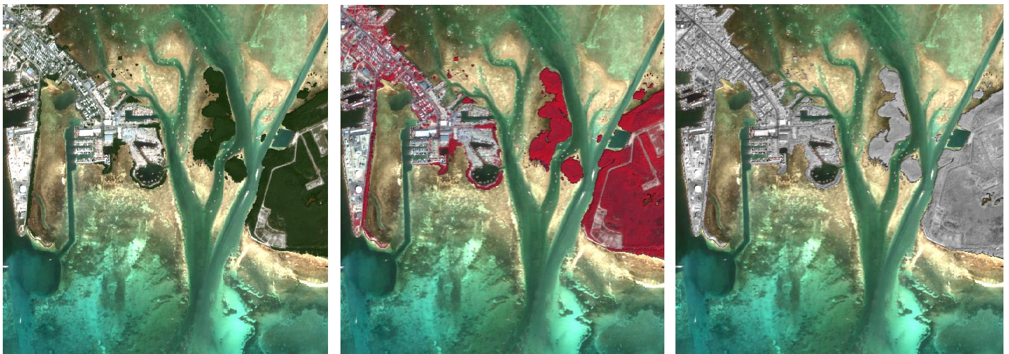
Sample results from WATER.sml with different options for land areas in the fused image

These illustrations of the Key West test area show sample results from the WATER script using different processing options for the land portion of the image. The water area in all images is an enhanced natural-color band combination that compensates for the varying