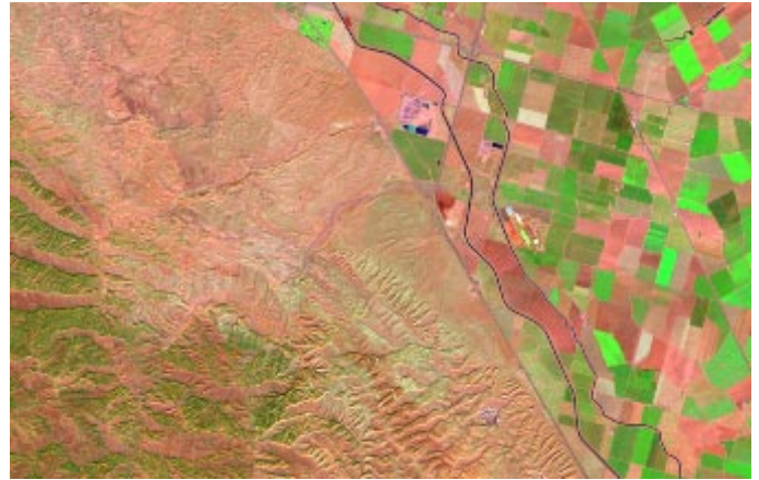
Processing with TERCOR.SML greatly reduces terrain shading in the southwest half of the image and more clearly reveals the ecological zonation of vegetation in this area. North-facing slopes have a more humid microclimate and denser green vegetation (shrubs and trees), while the more arid south-facing slopes are mantled with senescent grass and soil in this dry-season image. Band values in the flat agricultural area in the northeast portion of the image were not altered by TERCOR processing.