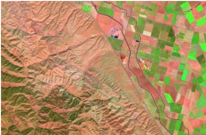
Scaled-reflectance bands produced by the SRFI script retain terrain-induced brightness effects in the hilly area in the southwest half of image.

False-color displays with RGB = Band 7, Band 4, Band 2, respectively. Vegetated areas appear green.