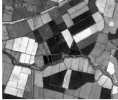
Tasseled Cap Component 2 (Greenness) for the same area computed from six bands of the SRFI-scaled Landsat 7 image. Bright tones indicate fields with the highest green vegetation biomass; fields with bare soil are dark.