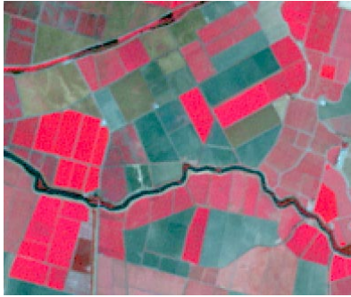
Color-infrared combination of Landsat 7 bands (corrected to calibrated surface reflectance using the SRFI script) for an agricultural area near Stockton, California. Bright red colors indicate fields with the highest green vegetation bio-mass; fields with bare soil are blue-green.

Multispectral satellite images of agricultural and range land can be used to map biophysical properties such as the surface color and moisture content of exposed and subcanopy soil, green and brown vegetation biomass, and others. Other applications include removal of the effects of unresolved intermittent grass and shrub cover to enhance the spectral mapping of exposed geological surfaces. The Tasseled Cap transformation simultaneously computes 2 or more biophysical indicators from a set of 3 or more multispectral image bands. It can therefore incorporate more information than ratio or modified ratio indices (like most vegetation indices), which use only a pair of spectral bands.