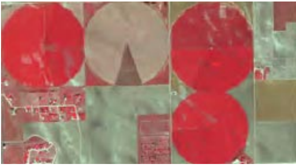
Color-infrared combination of QuickBird MS image bands for an agricultural area in Colorado. The three circular center-pivot irrigated fields that are dominated by red colors are corn fields near maximum biomass density. Color variations in these fields are due to both biomass density differences and background soil surface color and wetness variations. The top center circular field is newly-planted, with very low biomass density; the darker wedge-shaped portion of this field was wet from ongoing irrigation.