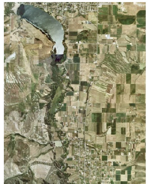
Left, a natural-color 1-meter orthoimage color-composite of an area in Utah, USA. Right, color-composite image produced by the Apply Contrast process using Exponential contrast tables for the Red and Green color components and a Linear contrast table for the Blue component.