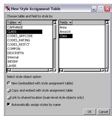
This window opens when New - by Attribute is chosen for the style.

The first steps in creating a new style assignment table are to select the attribute that will be used to assign drawing styles and how the associated style object will be handled. If you are creating a new style object along with the style assignment table, the style object is automatically embedded under the style assignment table. If you choose the