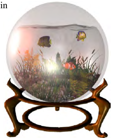
with (above) and without (below) alpha channel selected as mask

Because the alpha channel of a PNG file is an 8-bit opacity mask rather than a binary mask, it can provide antialiasing using partial transparency. A value of 255 in the opacity mask means that the display of the image raster is unaffected by the mask (100% opaque) while a value of zero means the image raster is transparent to the background (0% opaque, 100% transparent). Values in between have varying amounts of transparency. The alpha channel is accessed (direct display) or saved (import) as a subobject of the image raster object. Select this subobject just as you would any other mask to provide transparency in display.